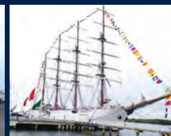
▲ Union from Peru