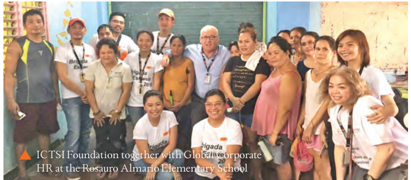
▲ ICTSI Foundation together with Global Corporate HR at the Rosauro Almario Elementary School

The Foundation's participation in the yearly brigada is done through its Employee Volunteerism Program, which encourages employees to participate in CSR activities for the benefit of the community.