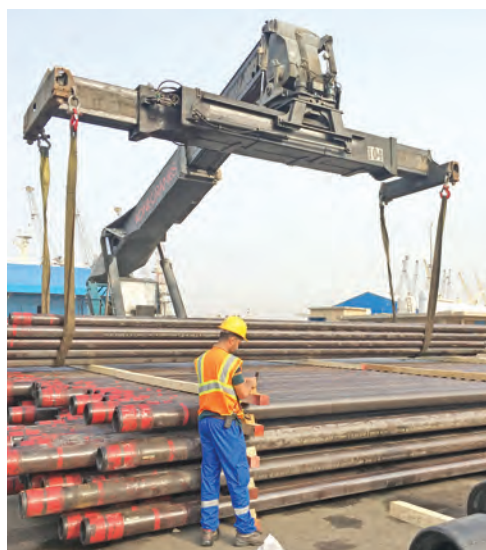
▲ Pipe imports handled at BGT for PetroChina