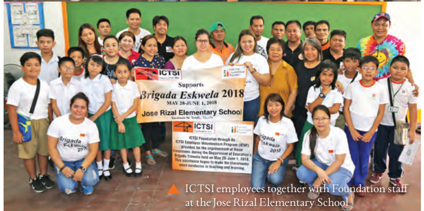
▲ ICTSI employees together with Foundation staff at the Jose Rizal Elementary School