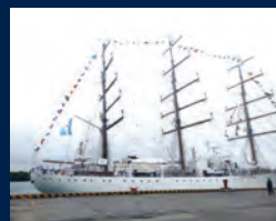
▲ Libertad from Argentina

A total of 11 training ships are participating in the 12,000-nautical mile regatta that started in Rio de Janeiro, Brazil on 25 March and will end in Vera Cruz, Mexico in September.