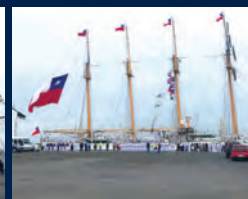
▲ Esmeralda from Chile