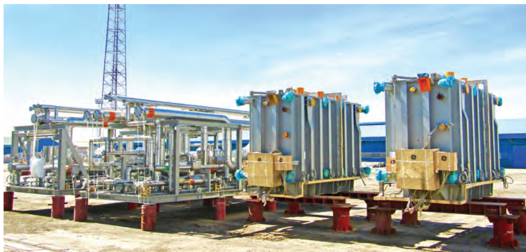
▲ Just recently, Berth 19 successfully received 139-ton transformers for General Electric—the heaviest ever to pass through the terminal's storage area. This shipment further demonstrates BGT's capability to handle complex cargos.

BGT currently supports business for several oil and gas companies like ExxonMobil, Southern Refinery Company, PetroChina, ENI, Halliburton, CNOOC, Missan Oil Co., and Shell.